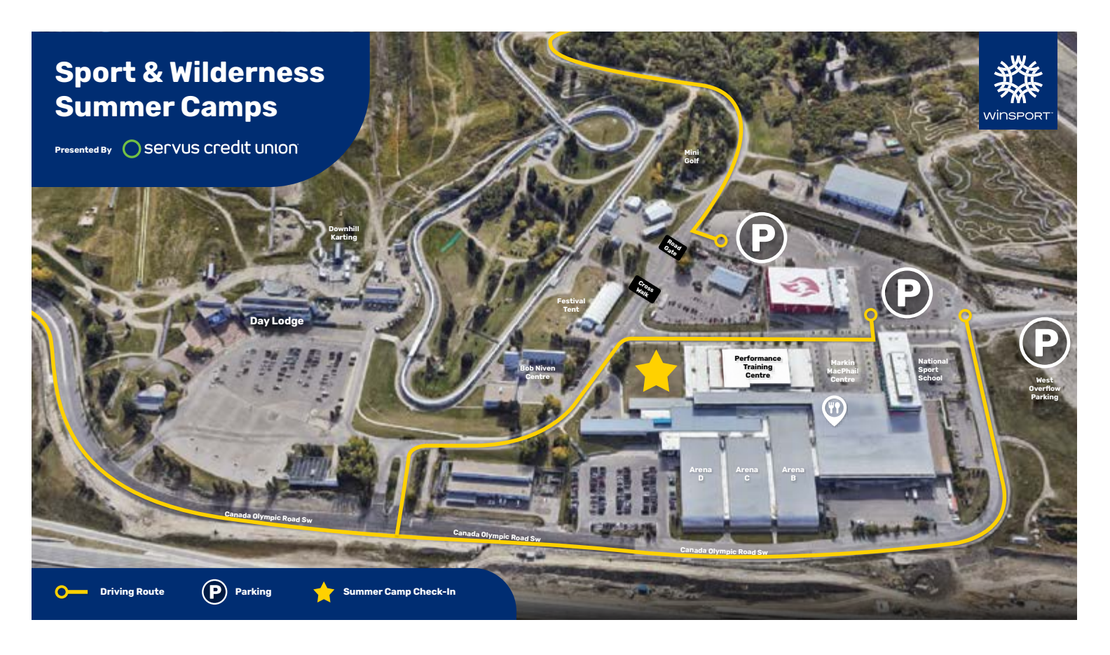
Click for high-resolution version