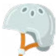
Half Shell Helmet