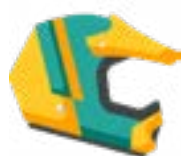
Full Face Helmet

Full-face helmets are required for Safari, Haircut Rabbit, Laserfade, and any black level trails in the skills center. Level 4 groups will advance throughout the week and may access these trails. Accessing these trails will require a full-face helmet and campers will be moved to a different group accessing different terrain if such a helmet is not provided or rented.