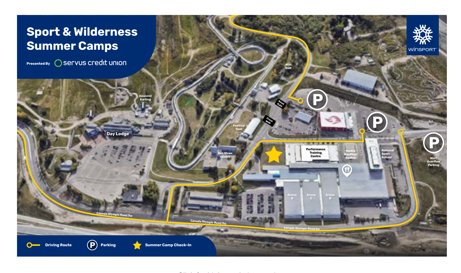
Click for high-resolution version